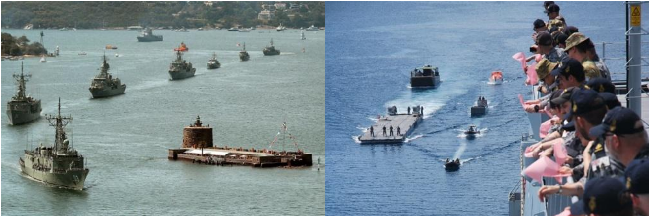
The Real Thing - 100 Years On..... and the Cheap Copy - Manus Island Style