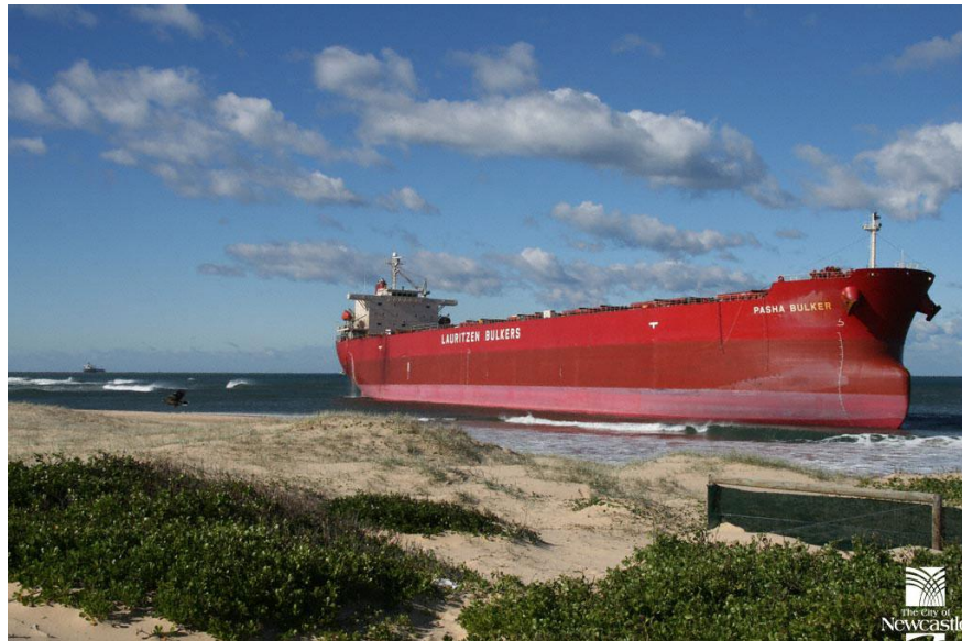
MV Pasha Bulker aground at Newcastle in June 2007

International obligations were explained (including pollution, wetlands and migratory bird species treaties), and also the regulatory and enforcement powers, including intervention, punishment and reparation that are part of the NSW Transport Department (Roads and Maritime) remit. Lessons from international incidents are important to inform future preparations for responses.