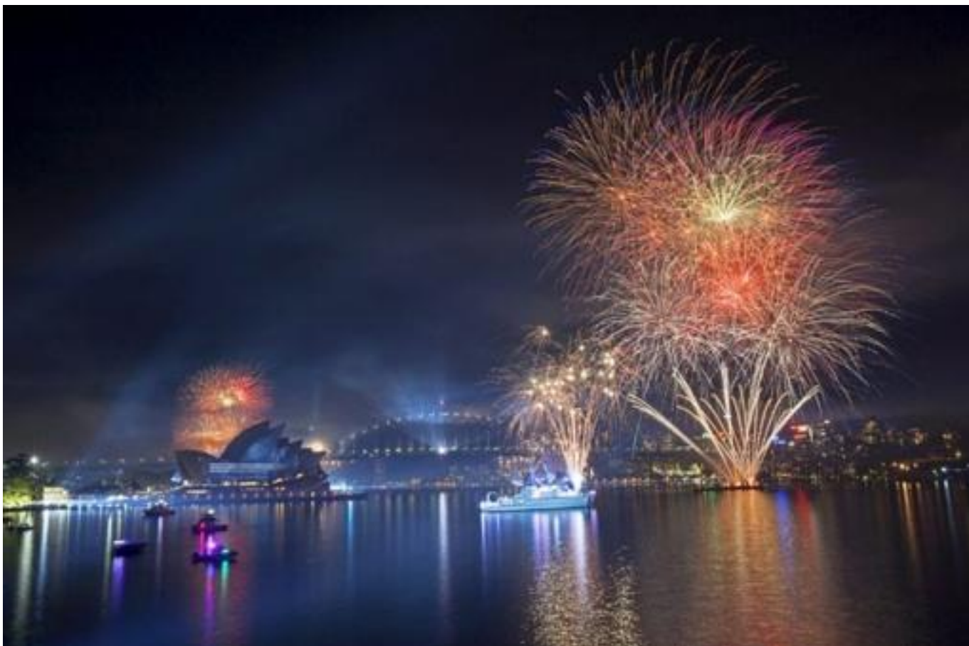
Royal Australian Navy International Fleet Review, Sydney